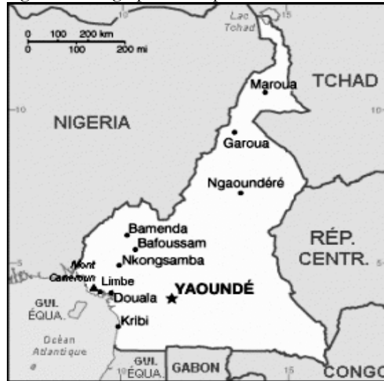
Figure 1: Geographical Map of Cameroon