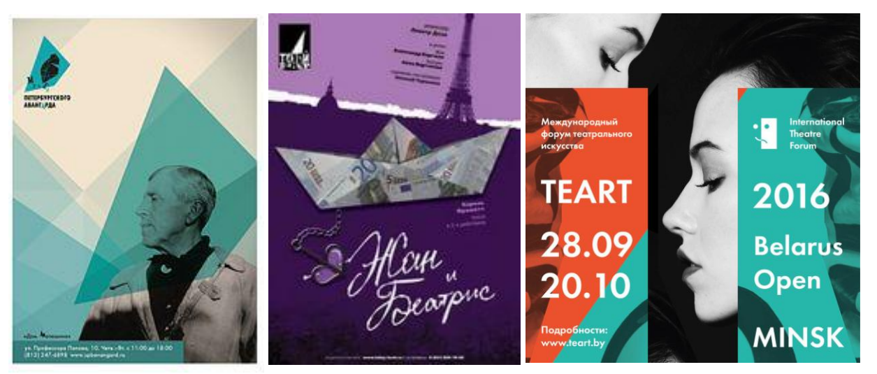
Figure 2. Example of designed advertising posters

The plot (decorative) side of artistic image in modern theater posters is usually based on a direct analogy or on complex synonymous links. In case of a direct analogy, theater posters use images from performances, decoration elements and theatrical decor, or portraits of actors. For museum exposition and exhibitions, images include elements of the exposition or historical reconstruction, or of exhibits or their elements. In case of a figurative solution, the plot can be more complex and constructed using metaphor, comparison, and metonymy. Most often, images in such theater posters are not recognizable illustrations, but fragments and elements of a common visual system. In addition, the methods (forms) of presenting the graphic material are an important characteristic of building artistic image in theater posters. It is the unconventional presentation of visual and image-bearing material that makes the poster attractive and memorable, and the performance (exhibition or spectacle) itself - bright and vivid.