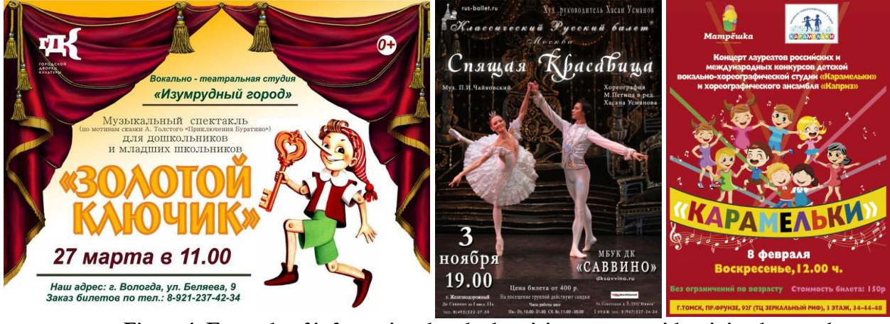
Figure 1. Example of informational and advertising posters with minimal artwork

The first group of cultural and entertainment posters is focused on the mass target audience and created in standard formats using photographic images. Most often, such posters serve as announcements. Their simple and precise composition and a clear illustration enables quick reading by an unsophisticated viewer. The main objective of these posters to notify viewers of an upcoming event: tour or theatrical performance, festival, concert, museum exhibition, or performances by singers or artists. The main information on such posters meets the basic advertising requirements: what, where, and when will the event be held. The simplicity of reading the information leads minimal artistic coding of the image. This is why very little attention is paid to the artistic and image-bearing side (Fig. 1).