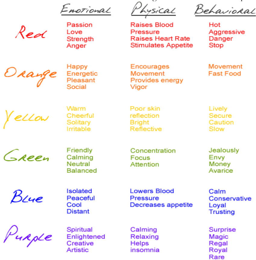
Figure 3. Psychological meanings of different color combinations

In modern advertising posters, both complementary and contrasting color combinations are used. Contrasting, unconventional color combinations pull the posters out from the surroundings of modern outdoor advertising. Yellow and violet shades, complex green and emerald colors, blue and orange-terracotta - these combinations suggest novelty and an unconventional image. On the contrary, the use of traditional warm beige, earthy, and ombre shades combined with dark maroon creates the image of a classical theatrical performance (Fig. 4).