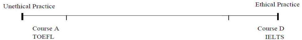
Figure 2. Ethical preparation courses

However, it should be noted that regardless of how “communicative” the design of the test was originally intended to be, its implementation as a required measure of English language proficiency has had the effect of encouraging the development of teaching and learning activities that are narrowly focused on test preparation. Thus, it is unrealistic to expect a preparation course be managed in the same manner as a general proficiency course.